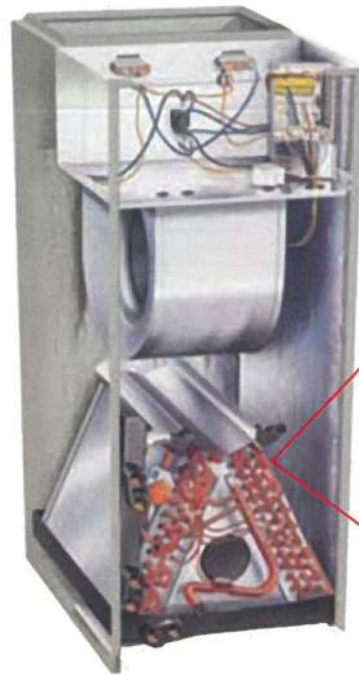
Air Conditioning Coil