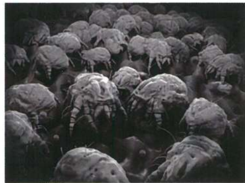
Dust Mites- a common indoor allergen

As this polluted air is absorbed into our skin, lungs, and blood cells, it often causes or aggravates allergic reactions, headaches, fatigue, recurring colds, breathing difficulties, dizziness, nausea, and serious respiratory diseases.